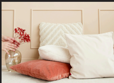
SEAMLESS COMFORT ELEGANT SIMPLICITY